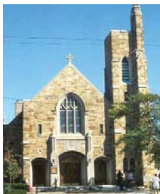
St. Malachi Church, 2459 Washington Avenue Cleveland, OH 44113-2380